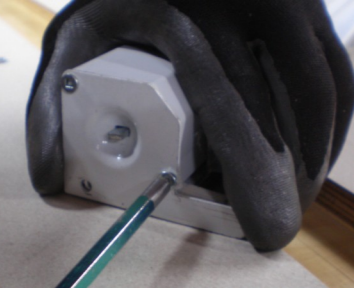
Re-attach end cap and tighten screws for both end caps.

Manufactured by Stollco Industries - Port Coquitlam, BC - 604.941.6291 - www.stollco.com