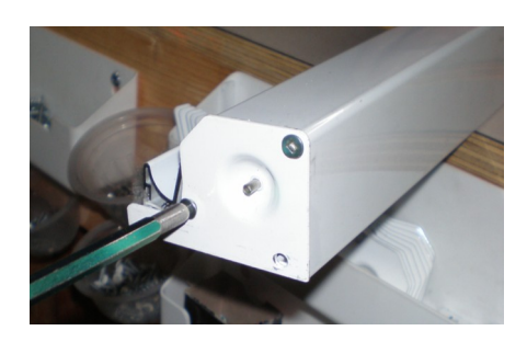
Loosen off round pin housing end cap